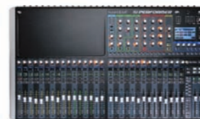
2 frame sizes are available: Si Performer 2 with 24 mic and 8 line inputs, and Si Performer 3 with 32 mic and 8 line inputs.